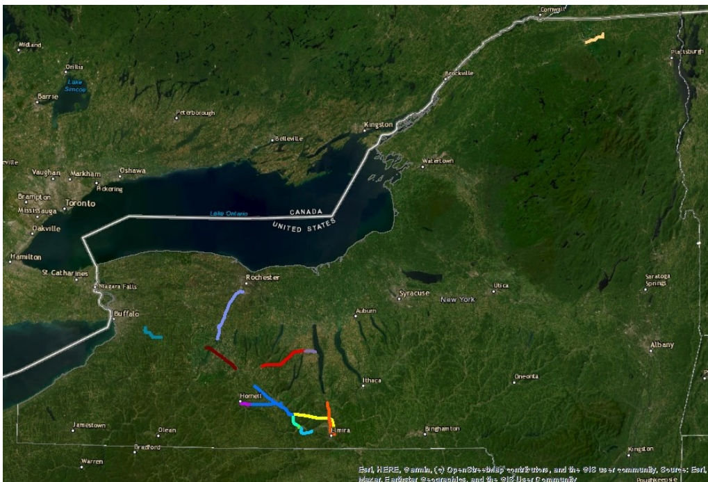
CLCPA Phase 2 Projects that are currently planned.

In total, Avangrid has committed to executing approximately $3.5B on CLCPA projects (*combined Phase 1 & 2) by 2030 in support of NYS climate goals.